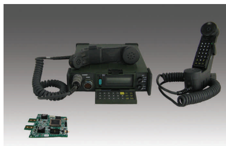
DSP 9000 Military Radio Encryption available in base station, handset and implant board configurations

TCC's Enhanced Domain Transform (EDT) encryption algorithm uses a "toll quality" voice digitizer. After conversion into a digital data stream, the voice signal is processed in both time and frequency domains in a manner that maintains the output bandwidth within the original 3kHz pass band. The recovered (decrypted) voice retains its original voice quality.