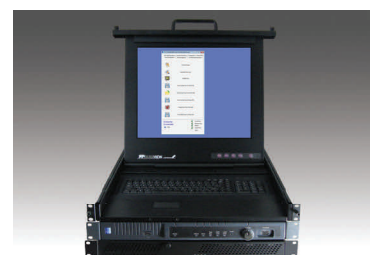
Crypto Management System rack mountable server and security vault